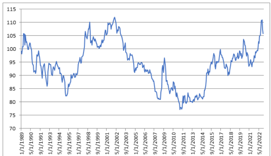
US Trade-Weighted Real Effective Exchange Rate, 1989-2022 Source: Citigroup, Bloomberg

Despite some volatility around the Great Financial Crisis, the dollar remained in its broad downtrend until mid-2011, when the prospect of an end to the post-GFC quantitative easing started an upward move in the dollar which we may still be in (more on this later).